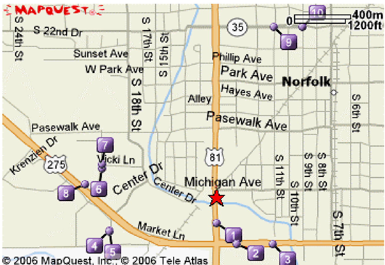
Map to Next Meeting at Norfolk Century Inn 1021 S 13th St Norfolk NE

When information is received I will update the newsletter on the website