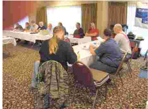
Business meeting is in session. There was a large number came to the class.