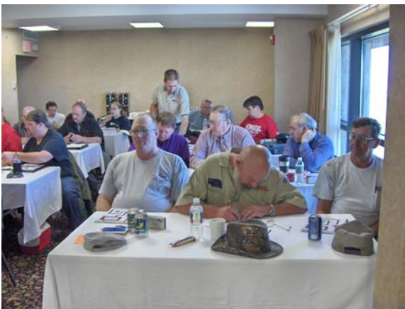
This association promotes complete families to come for the weekend. The locksmiths take classes and the ladies and kids go shopping. No one is left out.